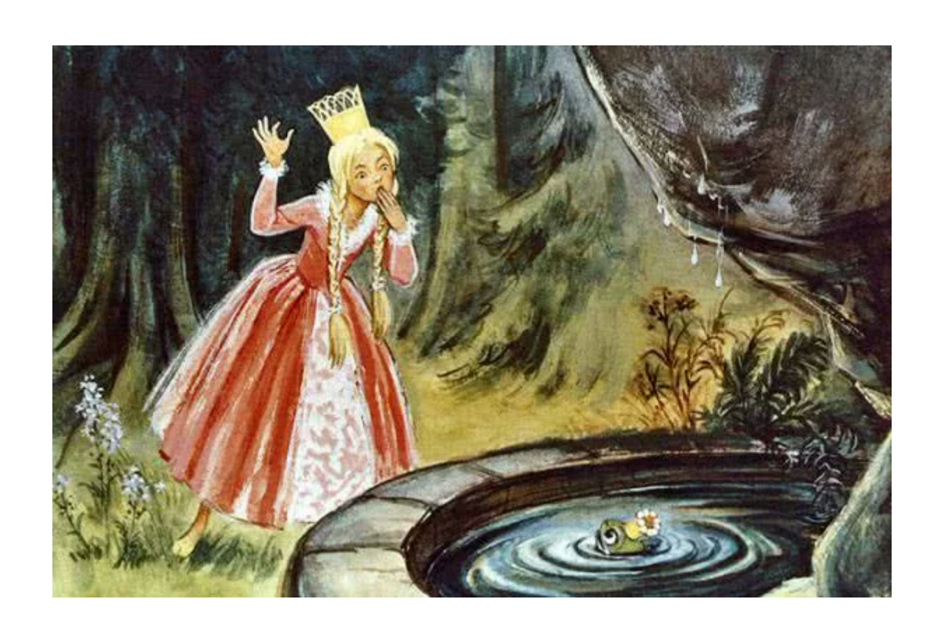
The Frog Prince