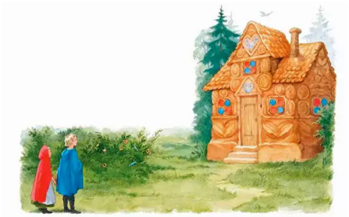
Hansel and Gretel