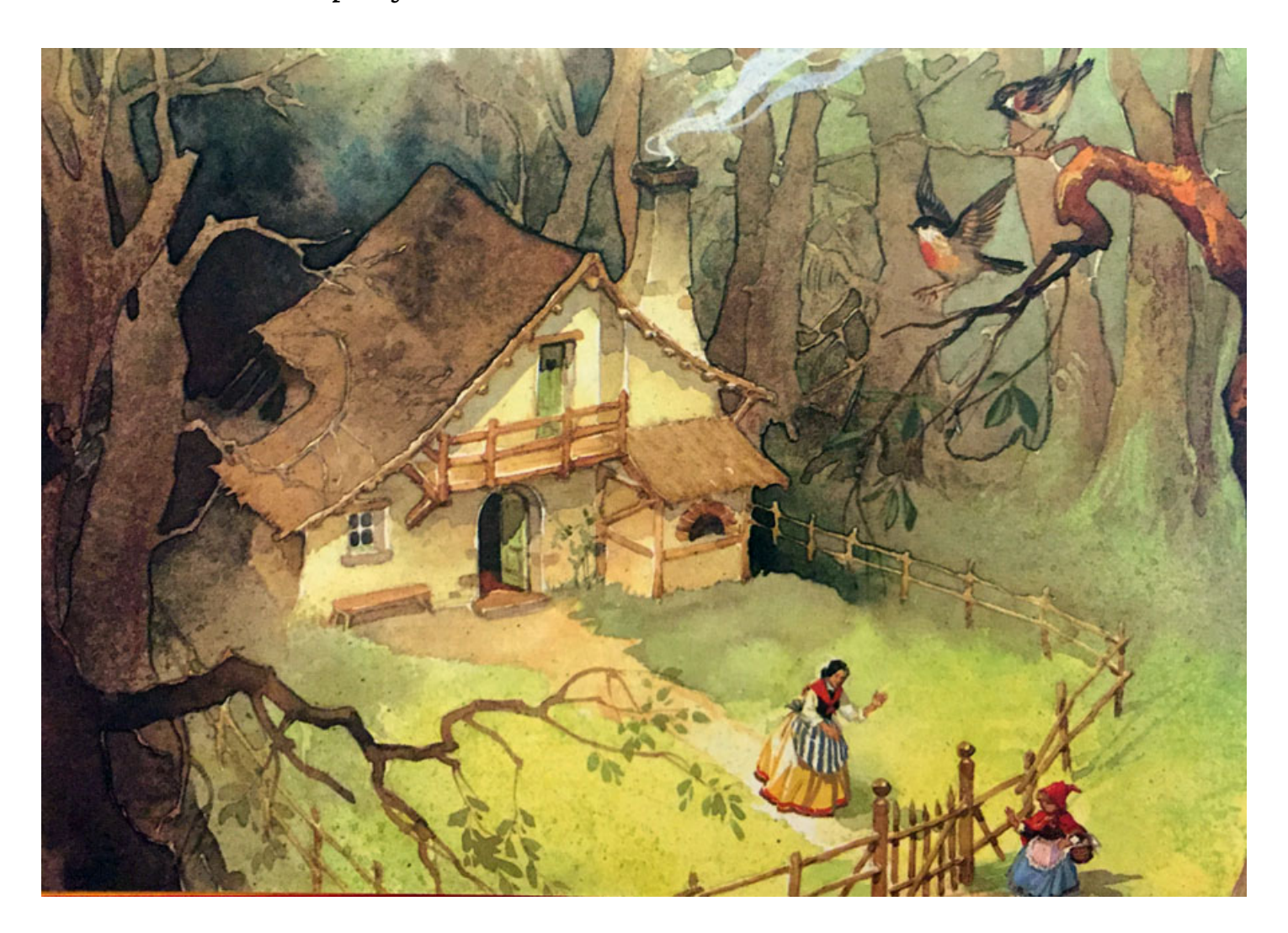
Little Red Riding-Hood set out immediately to go to her grandmother, who lived in another village.

"Go, my dear, and see how thy grandmamma does, for I hear she has been very ill; carry her a custard, and this little pot of butter."