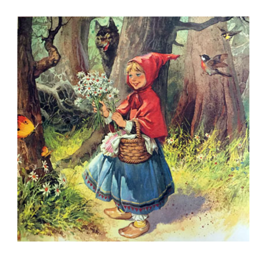
Little Red Riding Hood