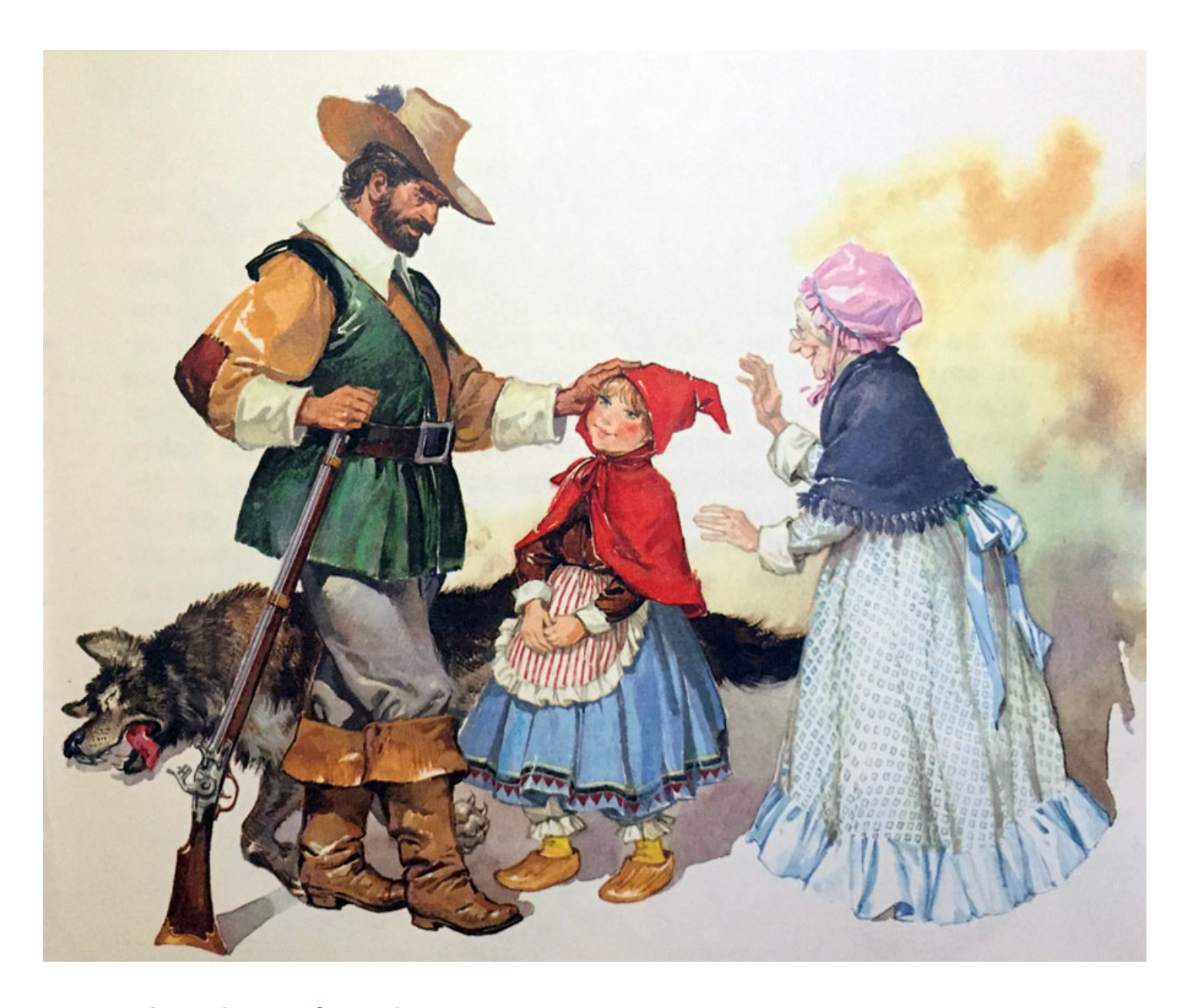
Fairy Tales on <a href="https://fairytales.site/">https://fairytales.site/</a>